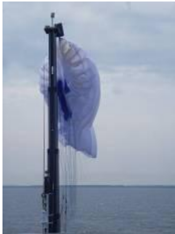
Launch & Recovery Mast